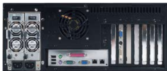
Supports Standard Motherboard Form Factors